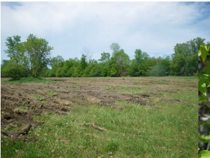
RE Smiths Falls 3 Project Site