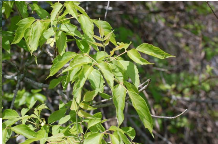
Manitoba Maple found on site