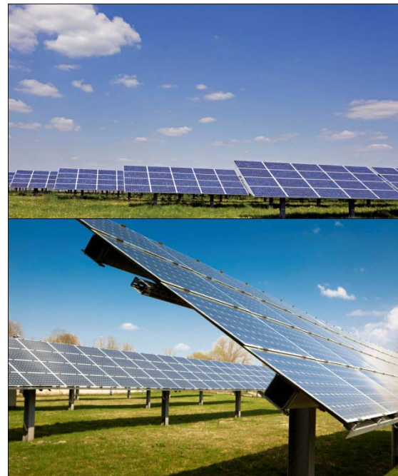
Examples of Comparable Solar Arrays