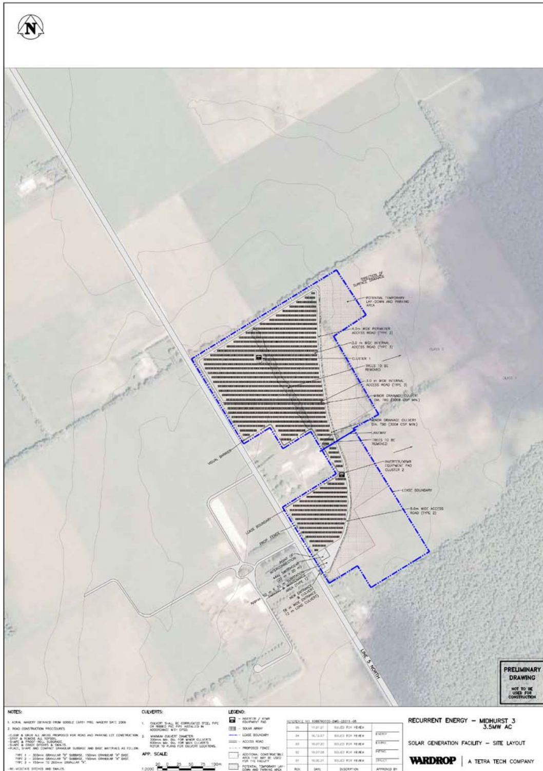
Figure 1: Site Layout