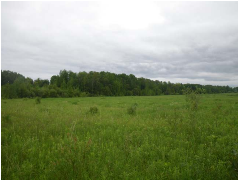
RE Midhurst 3 Project Site