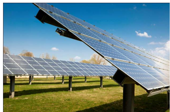
Examples of Comparable Solar Arrays